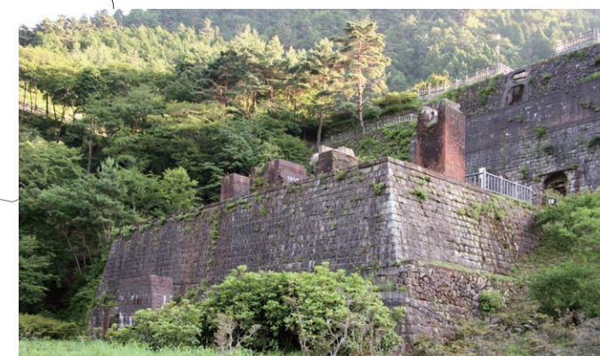
Besshi Coppermine Mountain To-naru Area

Embrace the magnificent view created by Shikoku's abundant nature!