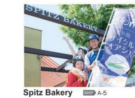
Spitz Bakery MAP A-5