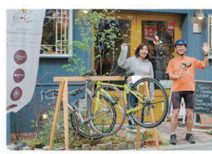
KOTOHIRA TRIP BASE -Kotori- MAP C-5

Providing cyclists with bike stands, air pumps, restrooms, and a place to rest.